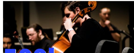
Figure 2.2. Main page. Users can contribute to a campaign via the Join campaign button

Turn a free public domain work into a ready to perform, digital score. With advanced machine learning and a bit of help from your community any orchestra can do it.