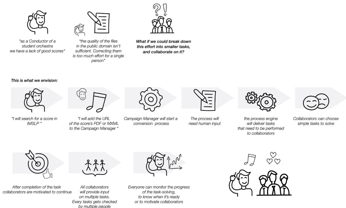
Figure 2.1. TROMPA orchestras conceptual user journey.

With the above in mind, we developed a prototype scenario where an amateur orchestra, in need of a performable score, collaborates in the conversion of a PDF-based score from the IMSLP library into a high quality MEI rendering of the same score. Such a prototype would allow us to gather insights on distributed collaboration within orchestras, add more MEI based content to the TROMPA CE library and provide an opportunity to road test the hybrid OMR functionality that TUD is developing under WP4.